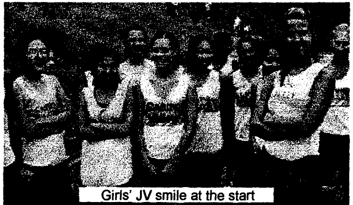
Girls' JV smile at the start