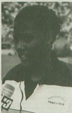
MARION JONES 100 & 200 Meters

Marion Jones is a classy, showy act, with the 10,000+ spectators gathered here each the year the largest crowd she has had to play to thus far in her career. Having set the current National Federation Record of 11.17 in this Meet last year, she did not let the fans down this year. Part of the difference in Marion this year is a rocket start that separates the powerful sixteen