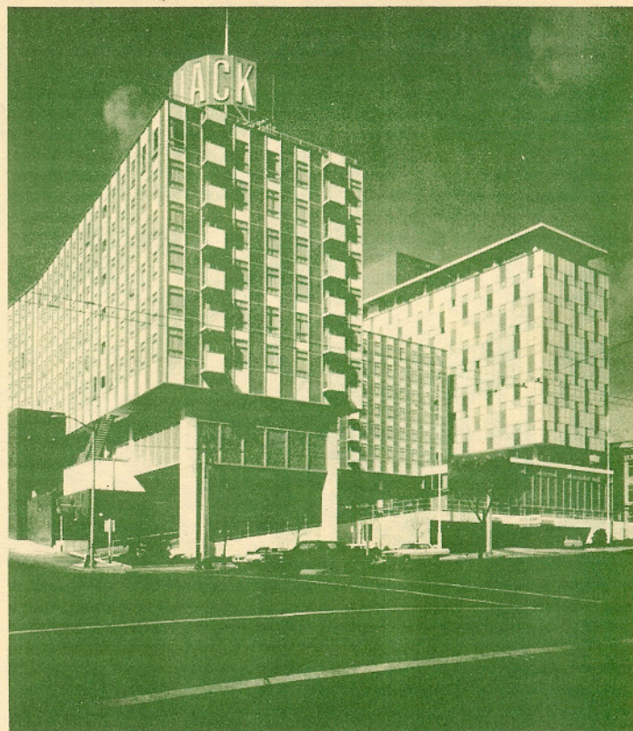
The magnificent JACK TAR HOTEL is the official hotel and headquarters of both the San Francisco Examiner and Golden Gate Invitationals. Located at Van Ness and Geary, this luxury hotel is within walking distance of many of San Francisco's outstanding attractions.

Young stars of the future introduced in San Francisco; Gerry Lindgren and Jim Ryun both received their first big-time starts in