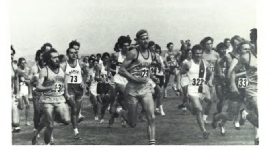
Start of the 1971 AAU Cross Country Championships, where West Valley TC took 2nd teamwise.