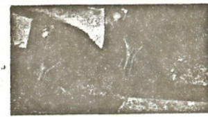
Bresnahan Starting Blocks (Pat. 2144962)