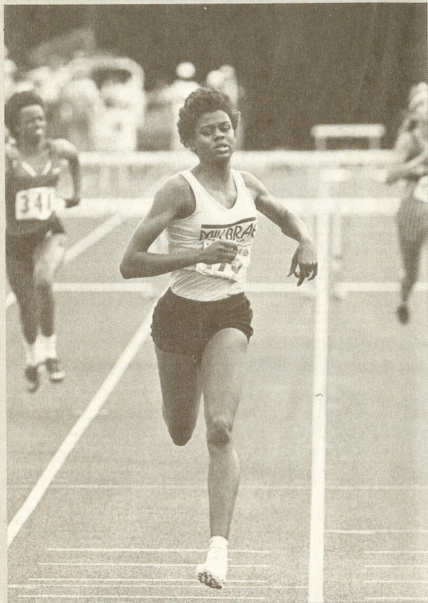
Women's Prep Athlete Of 1984